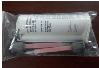
< 50ml cartridge >

The cartridge package contains 1 cartridge and 2 mixer tips. A cartridge dispenser is required for using the cartridge adhesive. Components A and B are separated in the cartridge chambers. The hardening begins when the A and B components are combined through the mixer tip.