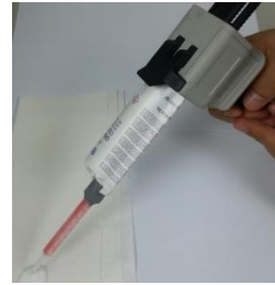
Discharge initial mixture