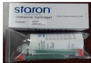
< 250ml cartridge >